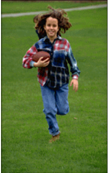
All of our activities are targeted to help young people

To develop optimism as a philosophy of life utilizing the tenets of the Optimist creed; to inspire respect for law; to promote patriotism and work for international accord and friendship among all people; to aid and encourage the develop-