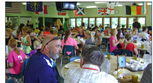
Campers at Camp Carson who we support

Although we come from all walks of life, Optimist Club Members share one common trait. We know that we can make a difference in the lives of others.